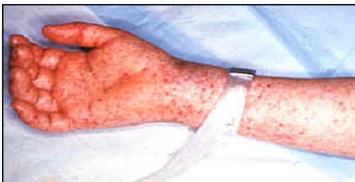
Spotted rash on arm and hand of RMSF patient.

From the third to fifth day of illness a red, spotted rash may appear, beginning on the wrists and ankles. The rash spreads quickly to the palms of the hands and soles of the feet and then to the rest of the body. However, only about half of RMSF patients develop a rash.