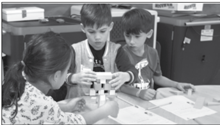
Second graders collaborate on a STEAM activity.

$2,270,875 This includes gifts, health services, and sale of obsolete assets.