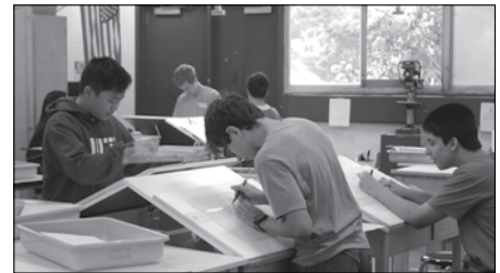
High school engineering students at the drafting table.