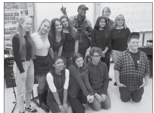
Visiting artists enrich the learning experience in Mahopac. High school choral students enjoyed time with American singer/songwriter Javier Colon this year.