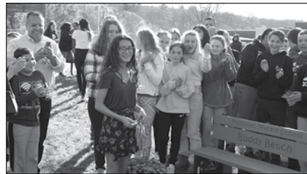
Middle school students celebrate the placement of their "Buddy Bench."