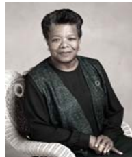
Maya Angelou (1928 - present)

I have wrapped my dreams in a silken cloth, And laid them away in a box of gold; Where long will cling the lips of the moth, I have wrapped my dreams in a silken cloth; I hide no hate; I am not even wroth Who found the earth's breath so keen and cold; I have wrapped my dreams in a silken cloth, And laid them away in a box of gold.