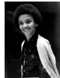
Nikki Giovanni (1943 - present)

Your skin like dawn Mine like musk One paints the beginning of a certain end. The other, the end of a sure beginning.