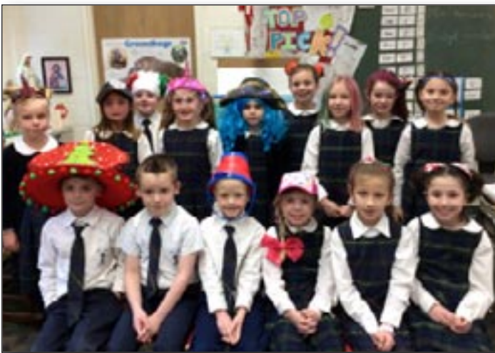
First graders show off their best during crazy hair/crazy hat day.

Finally, the children are beginning to make the transition from manuscript to cursive writing and, boy, are they excited! We started off with their names. We have now moved on to the lower case letters. Working on this