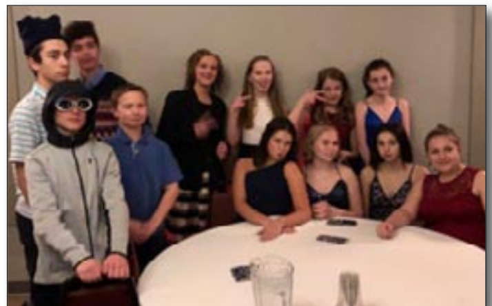
Eighth graders gather together at the recent annual Snowball.

Social Studies: We are very near the end of our unit on the Middle Ages. We have already discussed the Crusades and their effects on European life and culture. We will now learn about the increase in trade and wealth that led to increased population in towns and villages across Europe.