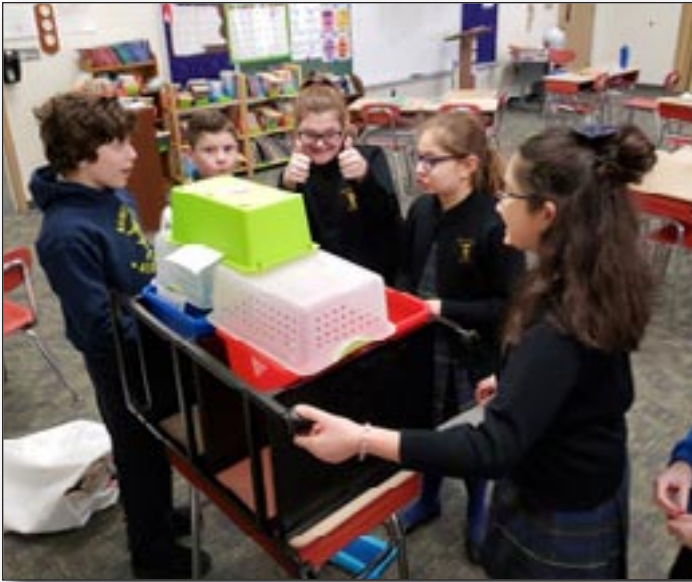
Fifth grade diligently works on a project.