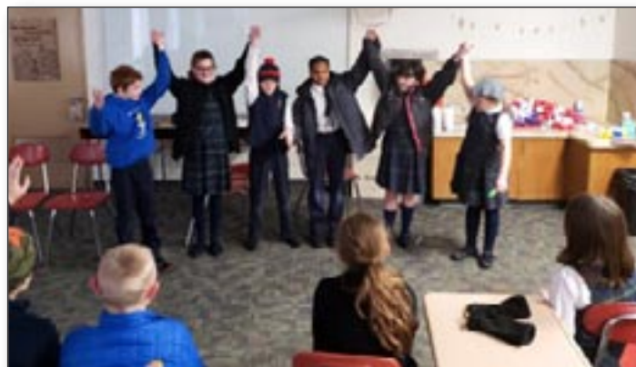
Fifth graders take a bow after acting out their version of Paul Revere's ride.

In reading, the class has been focusing on comprehension strategies to help them analyze various texts. The recent stories they have read in class have provided the opportunity to experience a play adaption of The Midnight Ride of Paul Revere and delving into drama with The Perpetual Motion Machine . These stories have really taken the interest of the students, and they have enjoyed working on props and practicing to perform for