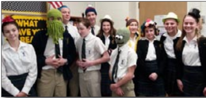
Eighth graders participate during crazy hair/crazy hat day.