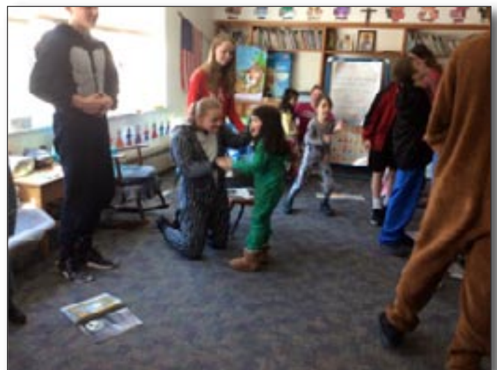
Kindergarten students with their eighth grade Big Buddies on pajama/dance day.

We had a fun and exciting Catholic Schools Week.