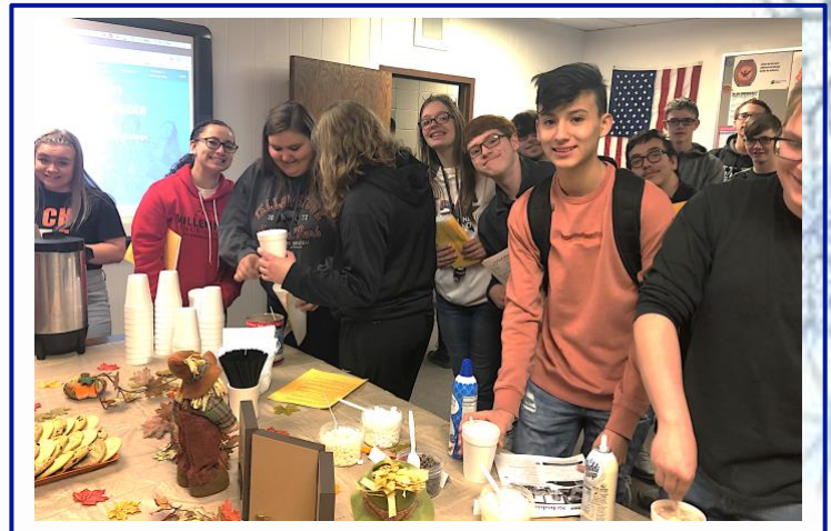
Hot chocolate and Hathaway Scholarship presentation at Rock Springs High School.