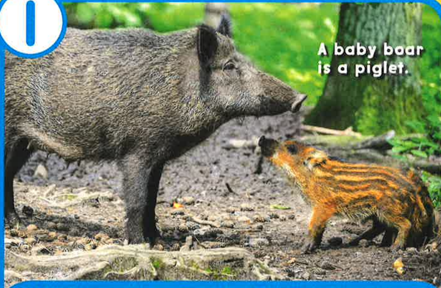
A baby bear is a piglet.

How is the baby boar different from its parent? It has stripes. Its stripes will fade as it grows.