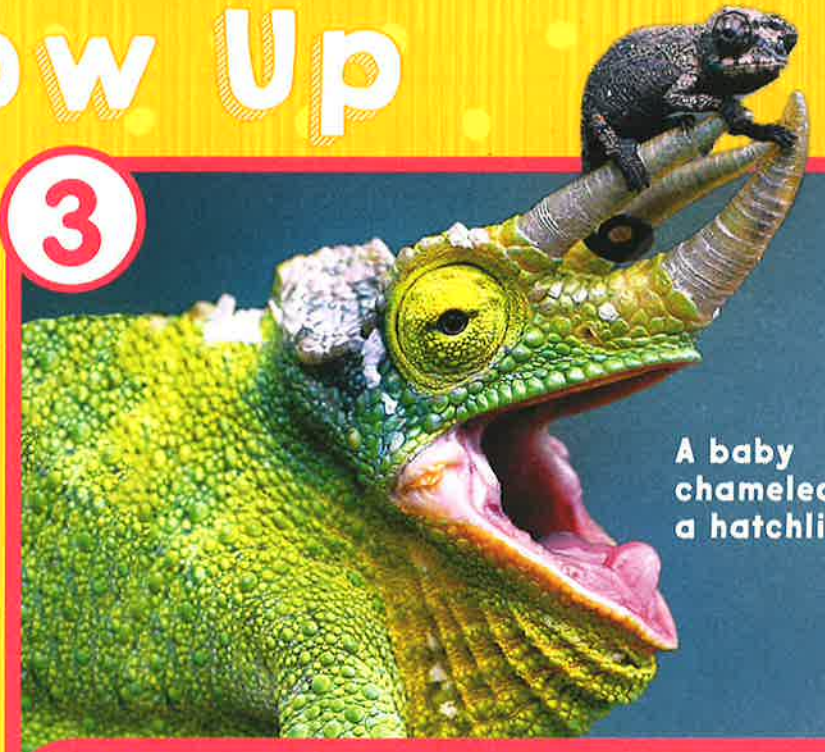
A baby chameleon is a hatchling.

How is the baby chameleon different from its parent? It has no horns. If it is a boy, it will grow horns.