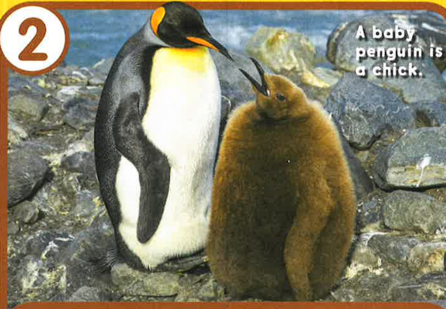
A baby penguin is a chick.

How is the baby penguin different from its parent? It is brown and fluffy. Soon it will get new feathers.