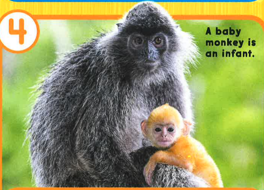
A baby monkey is an infant.

How is the baby monkey different from its parent? It has orange fur. Its fur will darken as it grows.