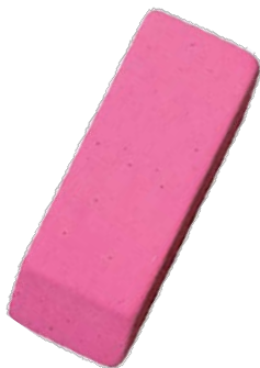
1 pink eraser