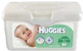
1 container of baby wipes without fragrance