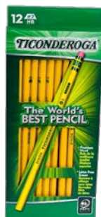
12 yellow pencils