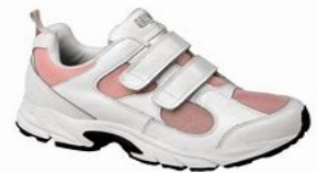
Velcro gym shoes (worn or brought to school on gym days, OR kept at school during the school year)