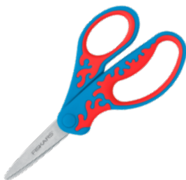
1 pair of scissors blunt tip, metal blades