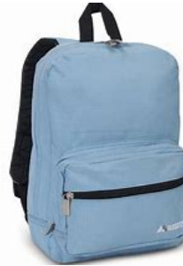
Backpack large enough to fit a folder (please label)