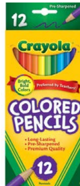
1 pack of 12 Crayola colored pencils