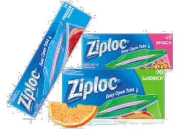
1 box of Ziploc Bags any size (Gallon, Quart, Sandwich, Snack)