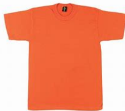
1 oversized art shirt (please label)