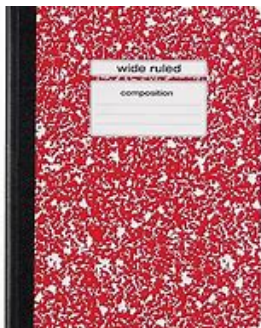
2 Composition Notebooks 1 black, 1 red, wide ruled

Please provide the following supplies to be used at school. Please DO NOT label the supplies. Continued on reverse side.