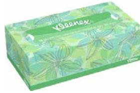
2 boxes of Kleenex