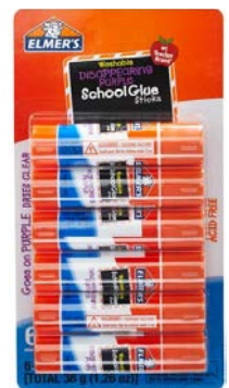
16 Elmer's brand glue sticks