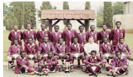
Red Rose Primary School Sports Team

purpose, and donating and Skyping with the people in Red Rose School is a very important thing to do. We hope that as you continue your time in East Side Middle, you keep in mind that there are others in need of your help, and some you have supported are at the Red Rose Primary School.