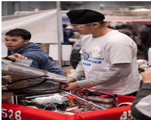
F.I.R.S.T Robotics Team