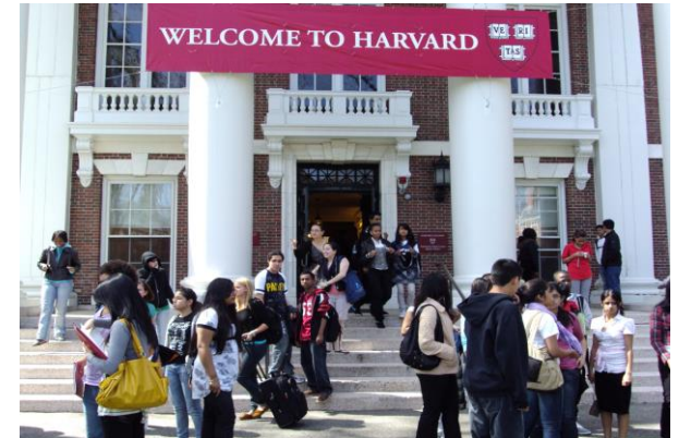
Annual Trips to Prestigious Universities