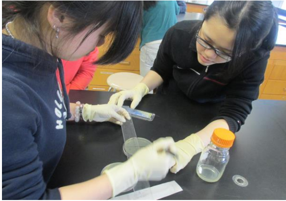
Hands on Science Experiments