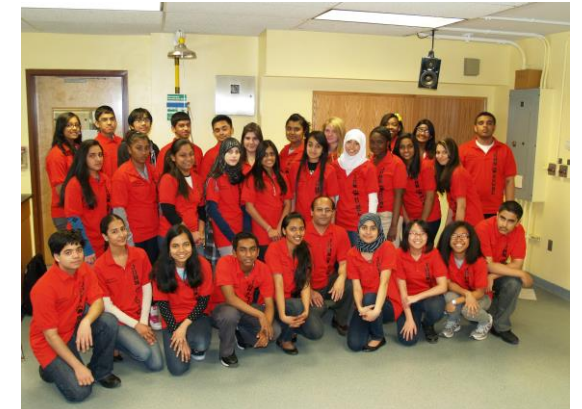
S.T.E.M. Students as Student Ambassadors, Leadership and Character Training