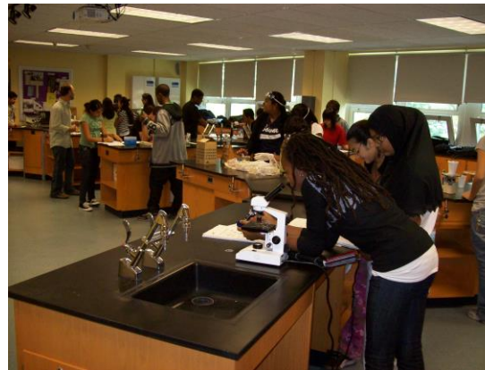
S.T.E.M. Science Research Lab