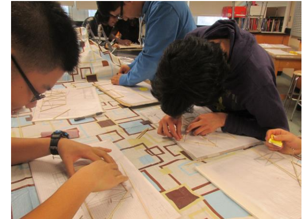
Students Building Model Bridges in the Civil Engineering Unit