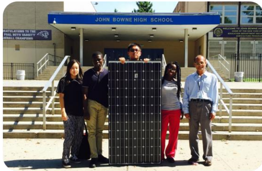
Renewable Energy Program: student working with solar panel