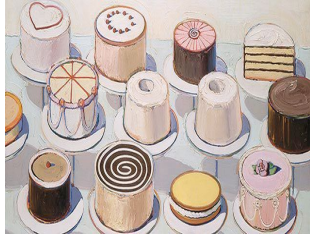
“A Sweet Art Lesson”