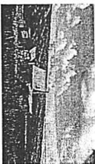
Baylor State University

The New Madrid, Missouri floodway was built in the 1930s to divert floodwaters from the Mississippi. Although the nearby farm is inundated by water, areas downstream were spared more extensive damage by utilizing the floodway.