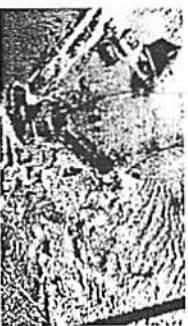
US Army Corps of Engineers

Following the Great Flood of 1927, the Army Corps of Engineers was again charged with taming the Mississippi River. Under the Flood Control Act of 1928, the world's longest system of levees was built. Floodways that diverted excessive flow from the Mississippi River were constructed. Reservoirs on major tributaries like the Missouri River were also built. By 1936, the Mississippi River had 29 locks and dams, hundreds of runoff channels, and 1000 miles of levees. Would this new set of flood control structures be able to contain a flood event?