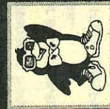
B. Cool, the mascot

The Saint Vincent College Prevention Projects creates, promotes and strengthens wellness in people and systems to prevent Alcohol, Tobacco and Other Drug abuse, violence and other socially destructive behaviors using education, early intervention and community development.