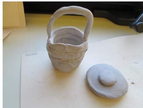
3rd Grade Pottery