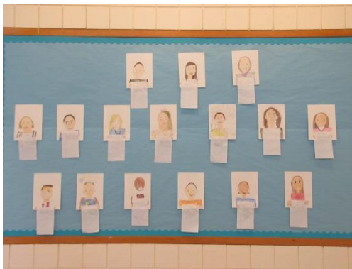
2nd Grade Self-Portraits displayed in the hallway

In 2 nd grade, we have started to learn about new color families, warm and cool colors. Students have created cool color paintings inspired by Claude Monet, designing their own bridges for their paintings and applying the paint in an Impressionist way (short, quick brushstrokes)! 3 rd grade has been working on completing our three-dimensional unit, creating beautiful pinch and coil pottery with clay, and paper sculptures. 4 th grade has worked on wrapping up our painting projects, learning many new color vocabulary words and creating lovely monochromatic winter paintings. Both 3 rd and 4 th grade will begin working on drawing skills next!