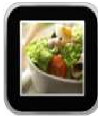
K-12 Food Service Program

Please Visit the CSDNR Web Store at https://nred.revtrak.net to make fee payments.