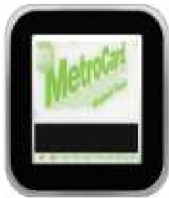
6-12 Metro Cards*

Go to https://nred.revtrak.net to make a quick payment in the evening or during your lunch hour with just a few clicks! Make payments online for: