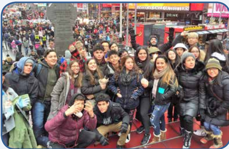
Students and teachers visit Times Square.

On a Saturday morning in December, I woke up early and went to my Saturday ELL (English Language Learner) class at Bayside High School. We were going on a trip to Rockefeller Center to see the big Christmas tree. At about ten o'clock, we all got on the bus and headed to Rockefeller Center.