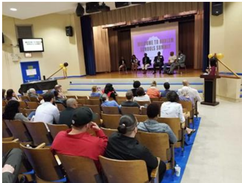
Advocacy in Action Panel

Director of Public Engagement and Senior Researcher at the Center for Educational Equity at Teachers College, Columbia University