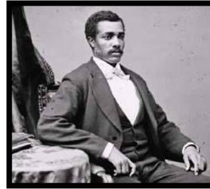
Hon. Josiah Thomas Walls of Florida between 1860 and 1875