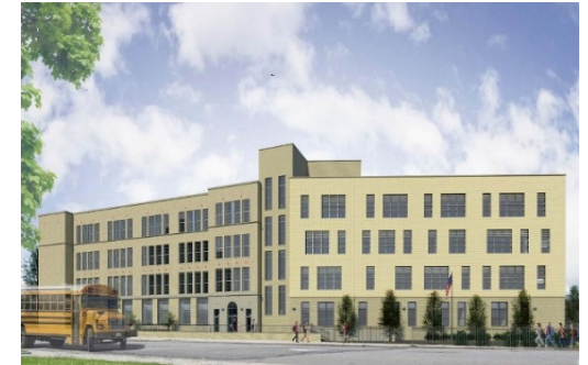
Rendering of P.S. 14 Addition