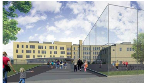
Rendering of P.S. 14 Addition

Current Throgs Neck Zones are represented by colors, proposed zones by black lines.