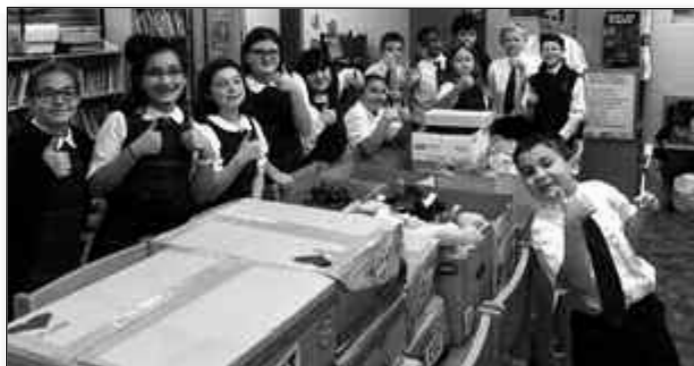
Each year the fifth grade takes the lead, spearheading the Box of Joy project which is supported by the school and the parish.

Social Studies: We are currently learning all about the earliest civilizations in the Near East, such as Sumer and Babylon. Part of this unit includes a discussion of the Seven Wonders of the Ancient World, which is always a favorite topic. We will be examining the details of those engineering marvels through a hands-on unit that will culminate in a project.