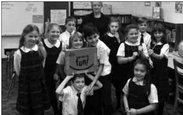
Fourth graders are ready to start a new project – writing a book. Stay tuned to see how it turns out.

In math, we are working on multiplication properties, models, special factors, and multiplying by one-digit numbers (with and without regrouping). The class has just received materials from Scholastic Book Club, as we will be publishing a class book on December 13. We will become authors and illustrators.