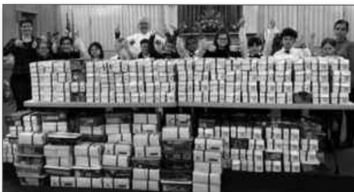
The fifth grade oversaw a successful Box of Joy with 350 boxes collected for needy children throughout the world.

The class also led Mass on All Saints Day and dressed up as a familiar Saint for a procession. In math, the class has recently finished their chapter on division with ten and larger divisors as well as the division of money. The students have begun using Khan Academy in math class on a regular basis, and have been doing well with the additional resource. The boys and girls have been working on comprehension of informational texts in reading class. Science content included discussion of adaptations of plants and animals and the technology of prosthetic limbs.