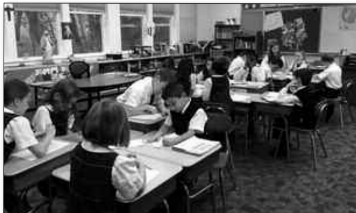
The third grade class hones their vocabulary skills.

In science, we had fun playing with a variety of objects and magnets. Students learned that magnetism and gravity are both a non-contact force that can cause an object to move or change position. In the next chapter, we will review different forms of energy. We will also