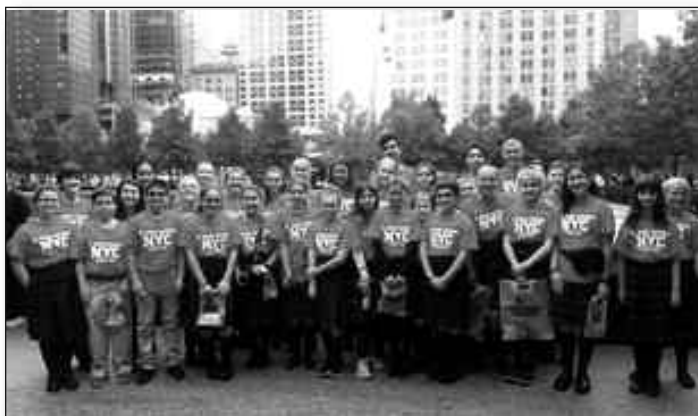
The Middle School had an enjoyable trip to the 911 Museum in NYC.

Social Studies Students recently finished major projects that explored the construction and architecture of Roman cities. This is always a fun project that requires students to only use recyclable materials. Now that the unit on Ancient Rome is finished, we will be working to learn more about life in Medieval Europe.