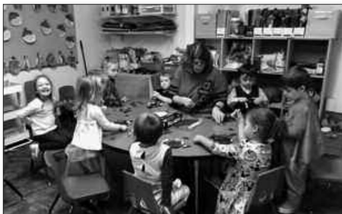
The pre-K is hard at work on a fun project.

During the last week of November, the pre-K class will be learning about hibernation, while the preschool