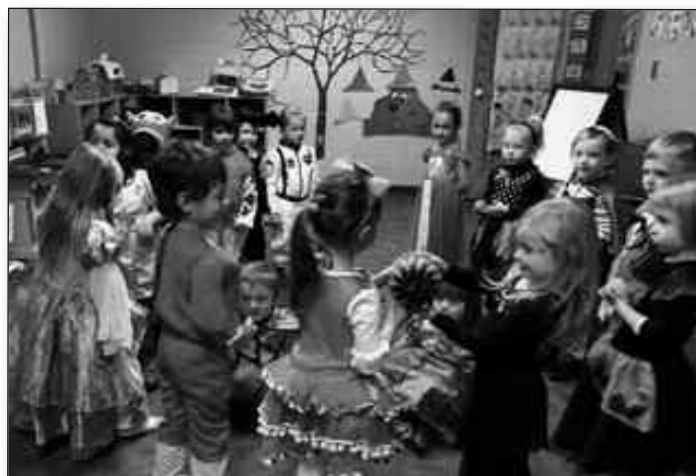
Pre-K 4-year-olds have a great time playing a Halloween game.

will be having fun reading and doing projects with these children's books: The Kissing Hand , Where the Wild Things Are , and If You Give A Mouse A Cookie .