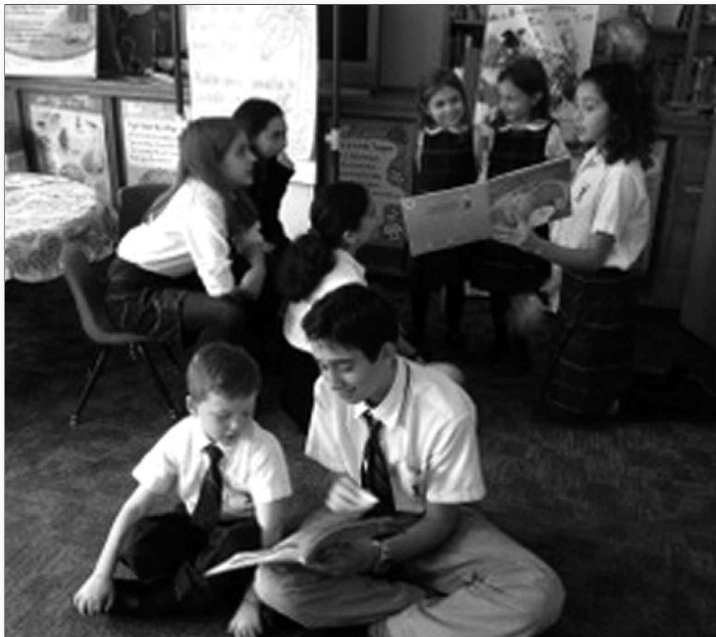
A St. Agnes Academy tradition is the eighth grade Big Buddy program with the kindergarten class.

Also, we have attended the first couple of sessions in the District Attorney's Peer Leadership Program. We look forward to learning skills such as critical thinking, decision-making, problem solving, communication, and self-reflection.