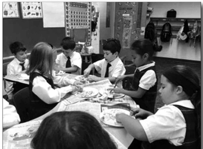
During science, second graders prepare for study of oxidation in apples.

To finish Apple Week, we made applesauce. The children cut the peeled apples with plastic knives, added the measured amount of sugar, cinnamon, and water and let it cook. The classroom was filled with the scent of applesauce and many students in other classes stopped by to ask what smelled so good. We're off to a great start!