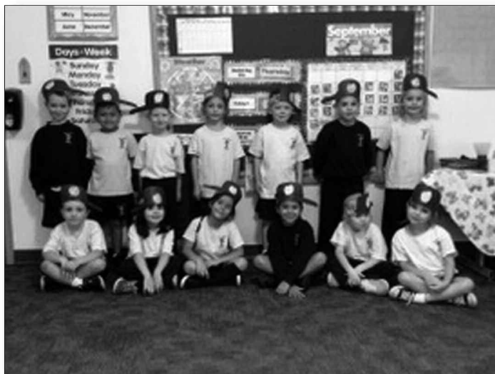
It's the fall season and kindergarten students pose with their Johnny Appleseed caps

We are looking forward to October as we will be celebrating National Fire Safety Week, in addition to looking for signs of fall.