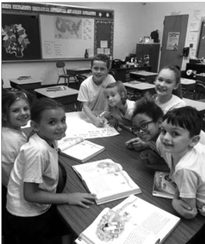
Math work in third grade includes a unit on sequencing.

In religion class, we have been discussing ways to make people, or each other, feel welcome. This can be in our neighborhoods, schools, classrooms, and church. We read about the Sacraments of Initiation and a message from St. Paul about loving one another and including one and all.