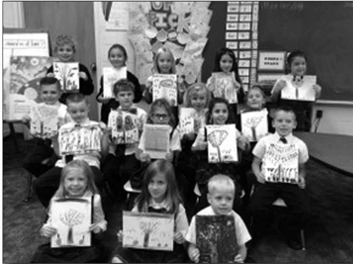
First graders show off their masterpiece fall art pieces.

me how they have helped someone and having a great first month of school!