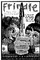
Frindle by Andrew Clements, Brian Selznick (illus.)