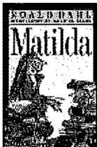
Matilda by Roald Dahl, Quentin Blake (illus.)