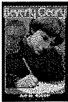
Dear Mr. Henshaw by Beverly Cleary, Paul O. Zelinsky (illus.)