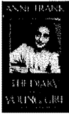
Anne Frank, The Diary of a Young Girl by Anne Frank

We want you to enjoy your summer with a good book. We would like for you to select ONE book from the list below. Then, complete a book report for extra credit using the template provided on the fifth grade website. The assignment is due Friday August 10, 2018.