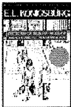
From the Mixed-up Files of Mrs. Basil E. Frankweiler by E. L. Konigsburg