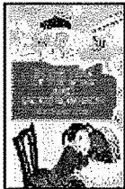
In the Year of the Boar and Jackie Robinson by Bette Bao Lord, Marc Simont