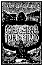
Chasing Redbird by Sharon Creech