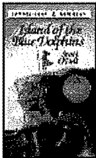
Island of the Blue Dolphins by Scott O'Dell