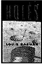
Holes by Louis Sachar