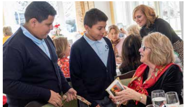
Eight Grade students of the Class of 2019 selling notecards created by The De La Salle School students and discussing their high school plans with donors at our annual Christmas Luncheon.