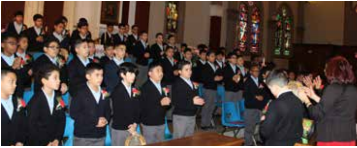
The De La Salle School celebrating the Advent Season and the coming of Our Lord during our 2019 Annual Advent Prayer Service.